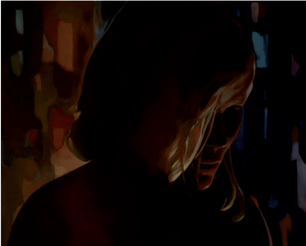
Monica Majoli, Black Mirror (Amy) , 2011 , oil on panel, 15 7/8 x 19 7/8". From the diptych Black Mirror (Amy) , 2011–12.

BRUCE HAINLEY ON THE ART OF MONICA MAJOLI